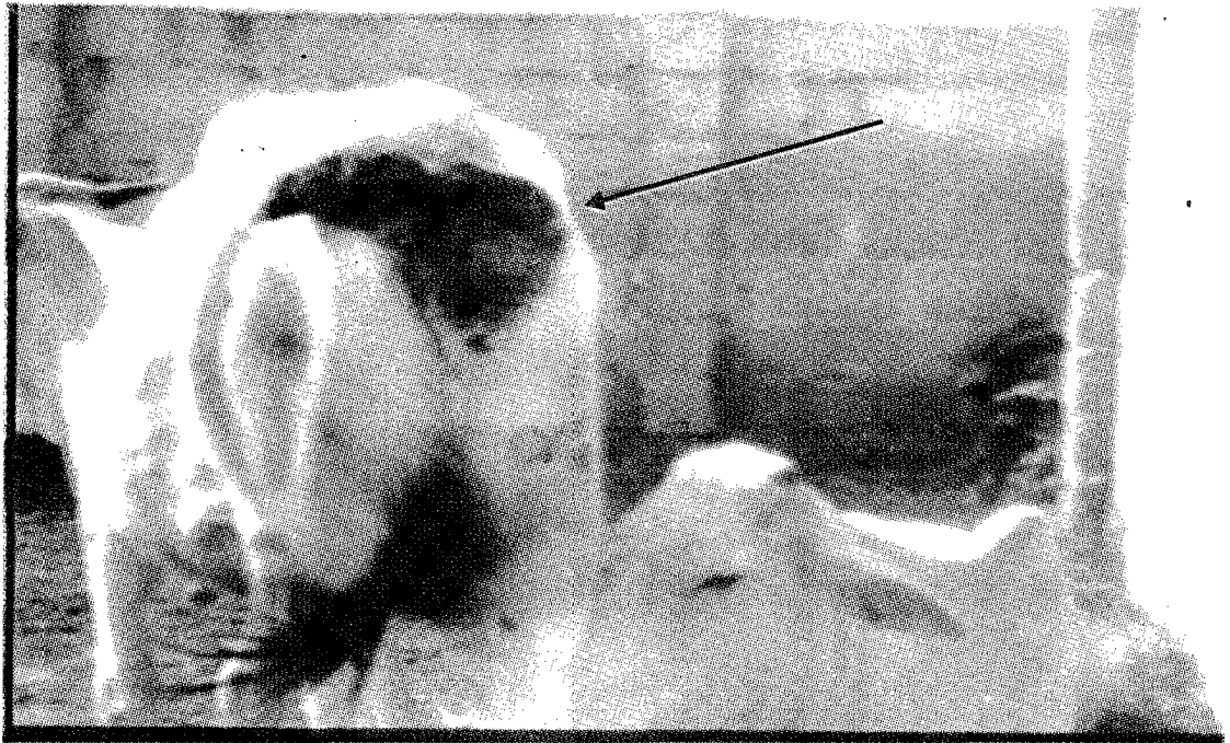
PLATE 2: Severe vulval dermatophilosis in a Bunaji cow, with tail pushed aside.

Ogwu et al. (1981) reported ovarian atrophy in moderately to severely affected female cattle with dermatophilosis. Dermatophilosis lesions mostly appear on the ventral areas of the body such as axilla, brisket, and inguinal areas, and in cattle, it occurs mostly on the scrotum or udder (Evans, 1996). Vulval lesions as seen in this case are not a common occurrence. The infertility associated with physical obstruction to penile intromission due to these lesions adds another dimension to the economic losses of the disease especially in the female. The intractable nature of the disease and the fact that the cow could not conceive resulted in the culling of the cow by the owner.