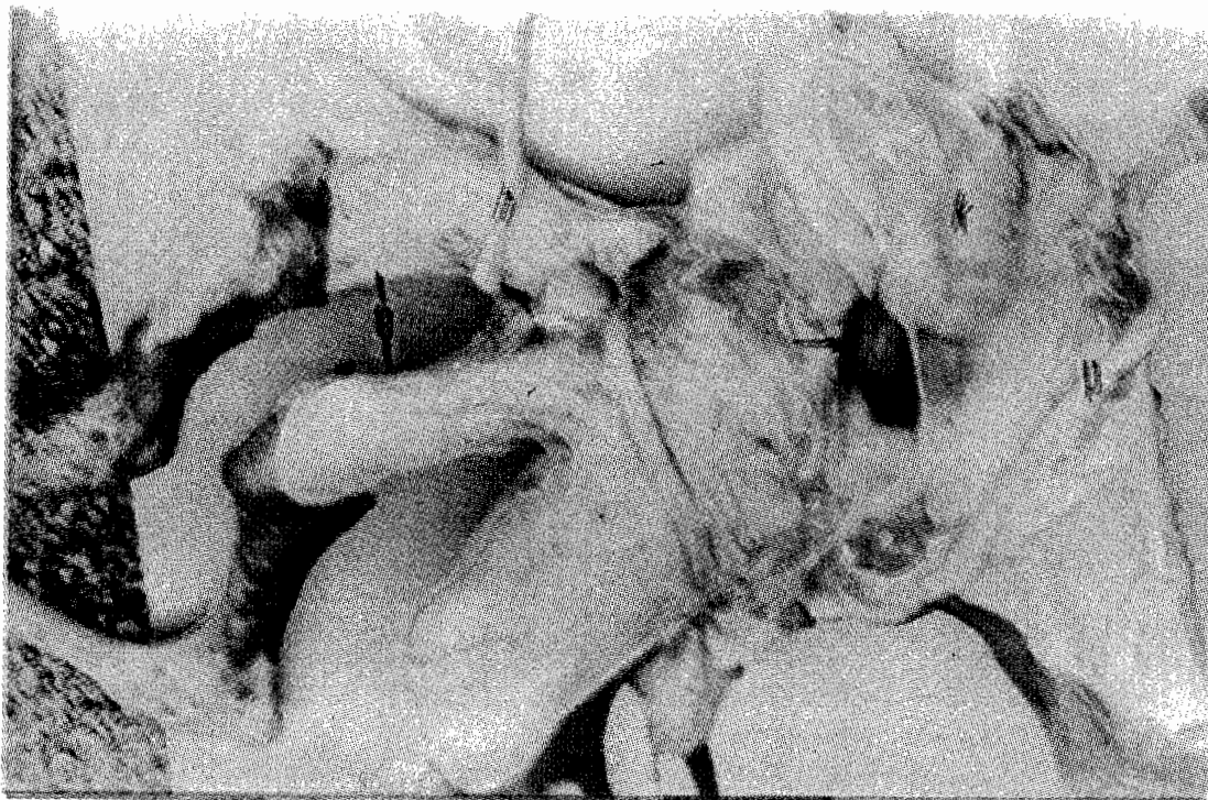
Plate 3: Note the extra hindlimbs (e), the developed penis (p), the hypoplastic penis (h), the hypertrophied common kidney (k) and the dorsally attached intrapelvic urinary bladder (arrow) of the bull.