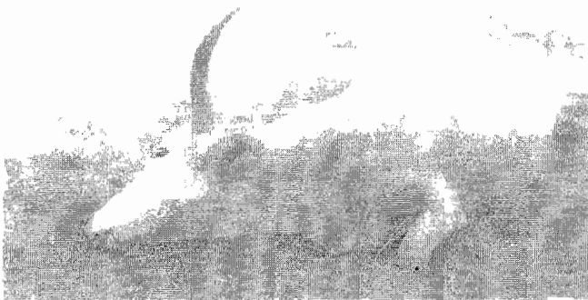
Fig. 2: Hindlimb paralysis and protrusion of the tongue