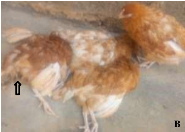
PLATE 1: Macropathologic images of fowlpox virus infection in 11-weeks-old brown pullets from a commercial flock in Zaria, Nigeria. A) Proliferative nodular skin lesions on eyelids, nostril and commissure of the beak (black arrows). B) Moribund and dead birds with soiled vent (black arrow).