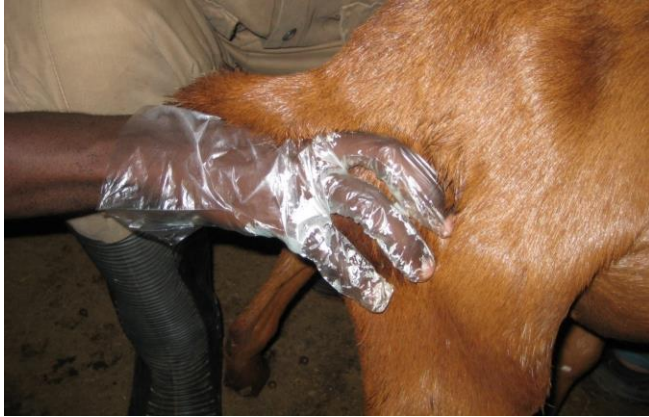
Plate I: Pregnancy diagnosis using Digital Rectal Palpation in Red Sokoto goat doe.

Using the cervix as a land-mark for identification of segments of the genitalia, the palpability, size, shape, consistency and surface characteristics of the vagina, cervix, uterus and ovary were assessed (Kutty, 1999; Bello et al. , 2021). Precautions observed for the procedure: examination was carried out before feeding and watering; fecal pellets were evacuated from the rectum; urinary bladder was emptied before examination.