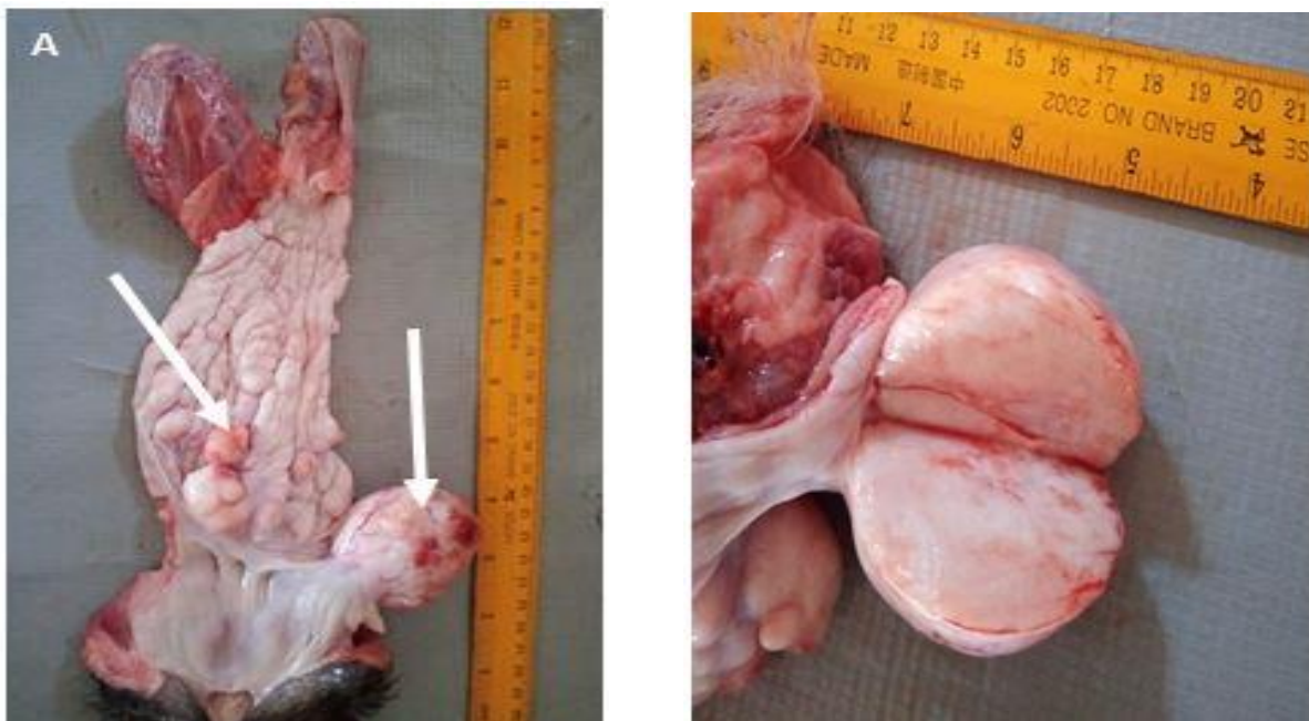
Figure 1: A. The vaginal cut open showing tumour masses measuring 0.4-0.6cm in diameter (arrows). B Crosssectional view of the vaginal mass

masses were seen on the vaginal wall (0.4-0.6cm in diameter). The following lesions led to the post-mortem diagnosis of leptospirosis: anaemia, haemorrhagic enteritis, and chronic nephritis. On a regular basis, sections of the mass on the vagina were kept in a 10% buffered formalin solution and prepared for paraffin embedding. Histological sections (4 mm thick) were stained with haematoxylin and eosin and viewed under a light microscope. Histopathologically, there were abundant densely packed spindle cells of uniform size, indistinct cellular borders, eosinophilic cytoplasm, and elongate, blunt-ended (cigar shaped) nuclei (Fig 3). The cells appeared grouped in broad interlacing fibres at angles of 90 degree in a “herringbone pattern” typical of smooth muscle tissue (Fig 2).