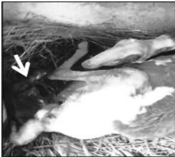
Figure 1: Recumbent Ewe after delivery of the first lamb (White arrow)

Clinical examination revealed the delivered lamb was still covered with amniotic membranes and grasping for breath. It was quickly lifted and dried-up. Abdominal palpation on the ewe revealed the presence of another foetus. About 20 mins after, uterine/abdominal contraction commenced but was not progressive. Amniotic sac appeared to have broken which was not successively followed with a relatively high intensity of contraction sufficient enough to cause expulsion of the foetus for about 30 mins. Insertion of gloved hand into the cervix showed a well dilated cervix and presence of foetus in the right parturition disposition.