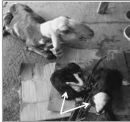
Figure 3: Images of the twin lambs (white arrows) with the Ewe

When twinning in ruminant may increase productivity and makes livestock more profitable as desirable in beef cattle production (Gregory et al. , 1996), twinning is undesirable in dairy because of its adverse effect on milk yield available for sale (Hossein-Zadeh, 2010). In sheep, occurrence of multiple pregnancies is also contra-indicated because it predisposes to pregnancy toxemia and associated post-parturient conditions (Schlumbohm and Harmeyer, 2008). Perhaps, the twinning observed in the present case may be partly responsible for the dystocia associated with lambing of the second foetus. Compromise of the expulsive force possibly due to hypoglycaemia or hypocalcemia after the delivery of the first foetus was apparently the primary cause of dystocia in this case