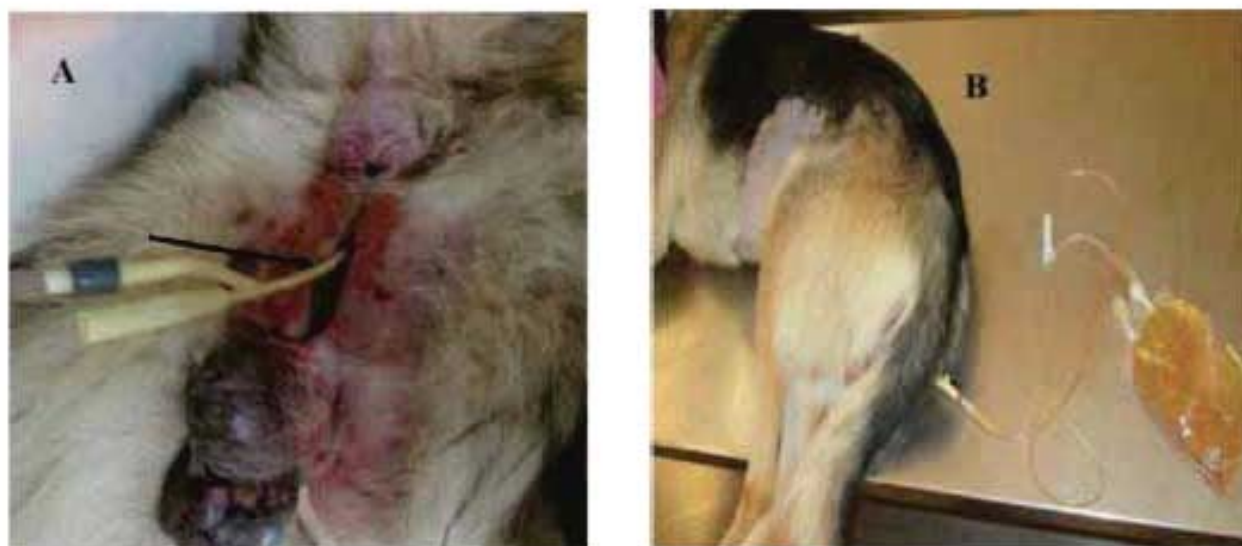
Plate IV: A, Transurethral catheterization through the ventral urethral opening at the perineum (arrowed) for antibiotic/antiseptic instillation and B, flushing/evacuation procedure

1 week; paracetamol injection at 10mg/kg was administered daily intramuscularly for 5 days. As the owner turned down surgical intervention of the condition despite history of recurrent urinary tract infection, urine scald dermatitis, and misdirection of the urine stream, the management ended at treating only the urinary tract infection. There was clear evidence of gradual improvement during the course of the management due to disappearance of the observed clinical signs. Eventually, the patient regained its strength and relatively became more active.