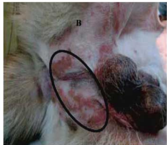
Plate I: A, Matted perineum with blood through the ventral urethral opening at the perineum (arrowed) and B, scald dermatitis (circled)