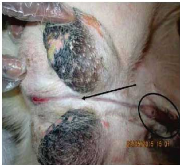
Plate II: Cleft scrotum (arrowed), hypoplastic penis and prepuce (circled)

Five hundred milliliter solution containing 480 ml of normal physiologic saline, 10 ml of 5 % enrofloxacin and 10 ml of streptomycin sulphate (5 g) was used to flush the catheterized urinary bladder (intracystic instillation) through the ventral urethral opening at the perineum over a period of 30 minutes. The solution was allowed to stay in the bladder for 30 minutes before it was evacuated through the same route of instillation (Plate IV). This procedure was repeated for 5 consecutive days. Enrofloxacin injection at 5mg/kg was administered intramuscularly daily for