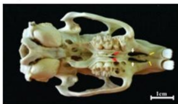
Figure 2: Ventral view of greater cane rat skull showing the rostral "unnamed" foramina (yellow arrows), incisive foramen (white arrows), and major palatine foramina (red arrows). Typical features of the rodents' skull were observed. The frontonasal suture showed variations in shape with wedge, transverse and U-shaped rostral tips. All males (100%) had transversely oriented rostral

presented 4 typical processes namely: the angular process, coronoid process, condyloid process and the incisor alveoli. The condyloid process was stout with articular surfaces on both ends, there was an angular process which extended about 1 cm caudal to the caudal vertical edge of the ramus and tapered curving slightly upward. The mandibular foramen was found typically midway between the coronoid and condyloid processes. Nutrient foramina were caudally situated few centimetres from the 3rd molar teeth. The mental foramen appeared to be represented by a collection of small foramina. The lateral surface of the mandible presented a tuberosity of varying prominence. This tuberosity is ventral to the 1st molar and rostral to a line which runs ventrally to join the angular process of the ramus. Dental formula was found to be I 1/1, C 0/0, P 1/1, M 3/3. All the skulls had erupted molar teeth.