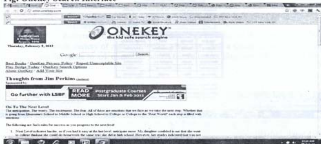
Fig: Onekey Search Interface

Other web-based resources that can be used to support teaching and learning in schools include: