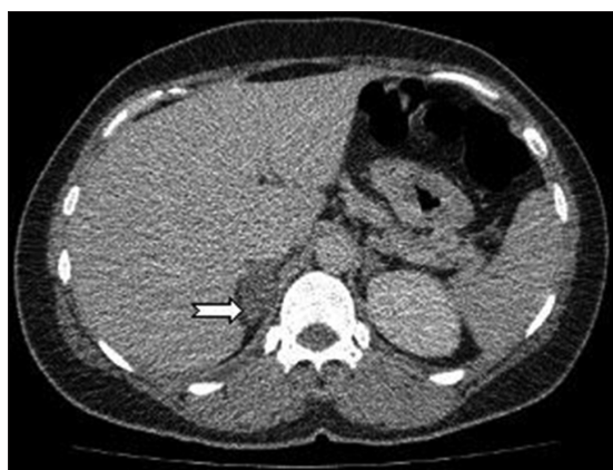
Figure 1: In axial contracted CT section in the right adrenal gland hypodense nodular lesion (white arrow) can be seen size in diameter 32 × 20 mm

*DST – Dexamethasone suppression test; ALT – Alanine aminotransferase; AST – Aspartate aminotransferase; LDH – Lactate dehydrogenase; CK – Creatine kinase; NA – Sodium; CA – Calcium