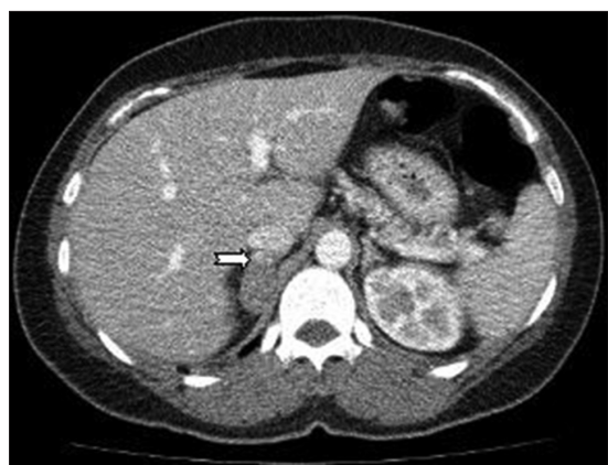
Figure 2: In axial cross-section dynamic contrast-enhanced CT, anterior part of the right adrenal gland showing the minimal contrast enhancement (white arrow) 20 HU density well-defined in diameter 32 × 20 mm nodular lesions observed

for adrenal surgery with the diagnosis of Conn's syndrome, and histopathology result was reported adenomas.