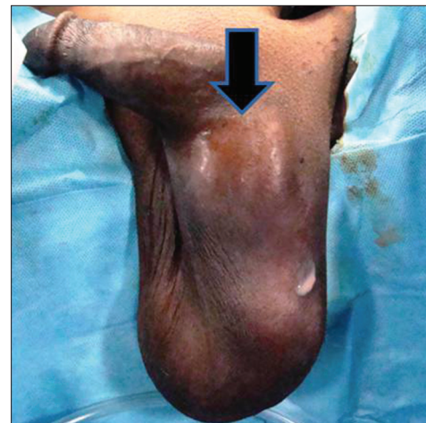
Figure 1: Clinical photograph showing swelling in scotoperineal region, which on compression discharged the pus per urethra

junction with trickling of pus. The prostatic urethra and verumontanum were normal. Prostate was de-roofed, but was completely normal. The most bulging point in the bulbar urethra was de-roofed, which drained 75-80 ml of copious thick pus. A suprapubic catheter was placed. His fever