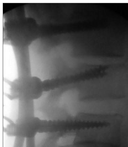
Figure 2: Fluoroscopic picture of lumbar pedicle screws in situ

general, there are two major laminoplasty techniques, unilateral (open-door) and bilateral (midline opening). Submodifications of laminoplasty include the use of bone graft or instrumentation (miniplates). In the current study we used the technique described by O'Brien et al. , using miniplates for fixation of the hinged lamina. 14 It is widely regarded as a simple, safe, and cost-effective method for cervical spinal cord decompression. The procedure is also quick and associated with minimal blood loss [Table 2].