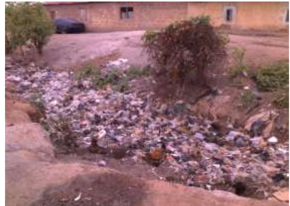
Plate 2: Drainage filled up with waste.

They concluded that Environmental management as part of an integrated vector management framework for malaria control is expected to reduce malaria transmission. Communal wastes blocking the open drainages because of poor sanitation of the site contribute largely to the high prevalence. Typical per capita solid waste generation rates for residential areas in Ilorin is 0.22kg per capital per day (Aremu et al. , 2012). Agunwamba et al. , (1998) recorded 0.53 kg per capita per day for Onitsha. The Okelele community does not have good waste management practice; wastes are being dumped indiscriminately in the open drainages and other open spaces around the community with occasional open burning. The uncontrolled discharge of waste must be discouraged, and the displaced wastes in drainages and open places have to be collected.