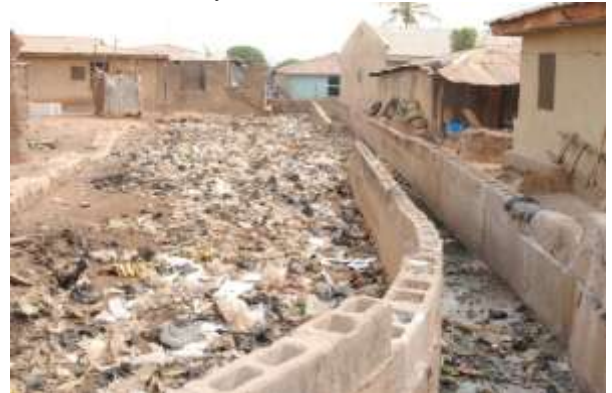
Plate 1: Typical solid waste content in the drain.

The result shows open drainage to be a significant factor to malaria prevalence in the study area. Castro et al. , 2009 conducted a similar study in Dares salaam, Tanzania.