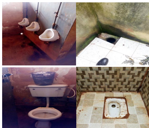
Figure 3: Sanitation facilities found in schools

supply usually results in a situation where toilets are not flushed even after repeated use by several students, thereby increasing the risk of infection and other health complications. Abundant water supply is a pre-requisite for ensuring public health. The above points are clearly buttressed by Figure 3 showing the squalid and dirty state of some of the school toilets.