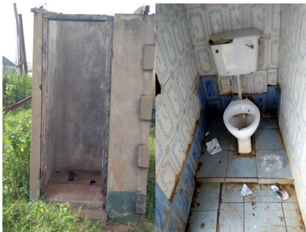
Figure 4: Dilapidated sanitary facilities

The mission schools appear more committed to cleaning their toilet facilities as 50% of them clean their toilets everyday while the remaining 50% clean them two to four times per week. The worst performing are government schools where only 15% of the schools surveyed clean their toilets every day, while 70% clean on two to four times per day and the remaining 15% clean fewer than two days per week. There is clearly a lapse in the area of toilet cleaning in the schools surveyed. This can be attributed to shortage of manpower to undertake such menial and demanding task. Besides, it is a low paid job which only a few persons are willing to take in the interim. The squalid state of these toilets (Figure 4) forces the children to hold themselves until they get home before defecating. Those who cannot bear the unending wait are compelled to use the toilet as they are or even resort to open defecation in bushes and farmlands around the school premises. When people are compelled to use dirty toilets due to certain circumstances, there is usually the tendency to mess it up further. Some children might even defecate on the floor if no one is around or climb the toilet seats to prevent their buttocks from being in contact with the contaminated facilities.