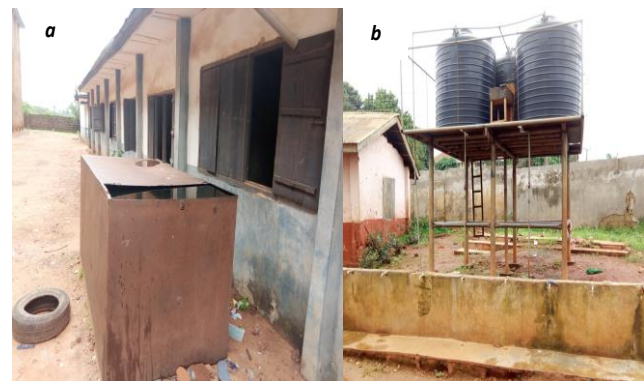
Figure 2: (a) Rain as water sources in a government school; (b) Overhead tank supply at a mission school