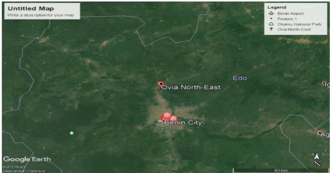
Figure 2: Location of Ovia-North East LGA in Benin City, Edo State, Nigeria (Source [23])

An observational checklist was used to conduct an assessment of the availability, maintenance and use of WASH facilities in the study area. About 15% of the questionnaire was ascertained for validity using Face Validity Method and reliability (using Cronbach’s Alpha Statistics). Cronbach’s alpha is a measure used to assess the reliability, or internal consistency, of a set of scale or test items and it normally ranges between 0 and 1 [24]. The questionnaires were structured to capture Socio-demographic, Water Supply, Sanitation and Hygiene Characteristics. Three hundred and ninety seven (397) completed copies of questionnaires were retrieved (estimated sample size). Hence, three hundred and ninety seven (397) copies of questionnaires were analysed. The retrieved questionnaires and Cronbach’s alpha reliability were analysed using Statistical Package for the Social Sciences (SPSS, version 26.0, 2018) and results were presented using descriptive tables. The sample size used for the study was determined using Yamane’s formula [25]: