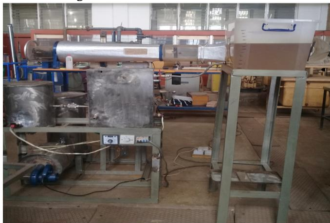
Figure 2: Experimental Set-up

Produced water was collected from Egbaoma flowstation, OML (Oil Mining Licence) 38 which is operated by Platform/Newcross joint venture after obtaining permission from the Department of Petroleum Resources (DPR). The sample collected was downstream of the well head as the well had 80% water cut. The decision to take from the well head was to obtain produced water without chemical injection. The crude oil sample with high water cut was left to settle then produced water was collected. The set-up is as shown in fig 3.3. Test samples A for oil and water content analysis was collected from the storage tank.