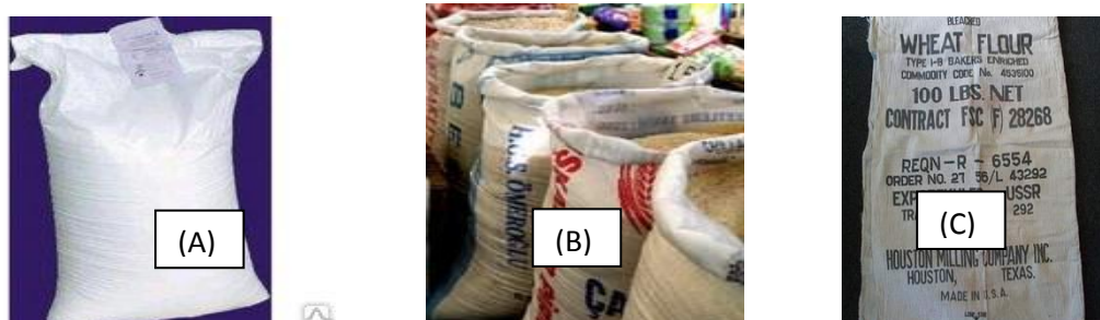
Figures 1: (A) Sugar jute sack (B) Rice sack and (C) Flour Sack

Three major types of Jute fiber reinforced composites sacks were commonly used by the local farmers for cassava pulp dewatering operations, these include; granular sugar bags labeled as sample (A), the rice sacks labeled as sample (B), and flour sacks labeled as sample (C). These three main sack types as shown in Fig. 1 were tagged with their common products for the purpose of this study for ease of identification. An existing hydraulic press was modified to accommodate a 9 ton hydraulic jack and two calibrated weighing springs for the determination of the applied force on the sacks as shown in Fig. 1.2. A calibrated transparent bucket was used for the collection of effluent to give an idea of the draining rate for each sack in the course of the experiment. Unsorted locally available fresh cassava tubers were peeled, washed and grated for this work. An electric oven and digital weighing balance at the department of Agricultural and Bioresources Engineering, Federal University of Technology Owerri were used to determine the moisture content of the product before and after each experiment. The moisture content was noted to ensure that each batch of cassava pulp used for the experiment was fairly at the harvesting level of about 65% (wb). A digital weighing balance was used to measure the weight of an empty can labeled 'Wc'. Sample of the pulp was placed in the weighing can of known weight and labeled 'Wc+s'.