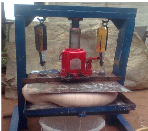
Figure 2: Experiment in progress.

The initial moisture content of the samples was determined using HME Global electric oven with model number PHD-9101-ISA England. The weighed sample was placed in the oven heated to 60°C for 60 minutes before it was reweighed and change in weight noted. To avoid the effect of sack over use or ageing with time, new and un-used sacks were selected for this study. The average tensile strength of the sacks were found to be 207kN/m 2 , 215kN/m 2 and 211kN/m 2 for Sugar jute sack (A), Rice sack (B), and Flour Sack (C) respectively. This agreed with the work of Mwaikambo, (2009) [10] and Prabakaran and Venkatachalam, (2015) [6], which reported the tensile strength of Jute fiber reinforced composites to be in the range of 2000-25000kN/m 2 . Each type of sack was loaded with 10kg, 15kg and 20kg of the fresh cassava pulp and dewatered in turn. The number of jacking strokes on the hydraulic jack was noted to keep the applied force fairly uniform in all trials. The dewatering force was intermittently applied until the breaking point (marked by a clique sound) of the sack was noticed. The force reading on the weighing balance at this point documented before terminating the experiment.