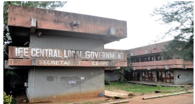
Figure 1: Ife-Central Local Government Secretariat

The energy consumption data (electricity bills) collected is not reliable as there are issues with most metering systems in Nigeria. So an attempt is made to calculate the actual energy demand of the building based on loads in the building. Table 2 below gives the electrical loads in the building, their quantity and capacity as well as estimated monthly total consumption. It should be noted that consumption is not constant every day and month. Demand normally increases during dry season in most Nigeria offices due to air condition being on most of the time for cooling. In the Table 2, miscellaneous loads account for other loads like phone charging, microwave heating, electric kettle for water heating etc. The idea is to obtain workable and reasonable estimate amount of electricity consumption in the building which should be very close to actual consumption. Figure 1 shows the Ife-Central Local Government secretariat building.