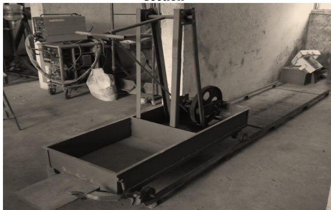
Figure 2: The rail road hand truck after construction

The frame is an assembly of welded sections upon which components such as the gear drive, bearings, stand, swinger arm, etc. are mounted. The frame ensures stability of the hand truck under load and was constructed using 50 x 50 x 5mm mild steel angle bar. As part of the frame, two supports of height 1500mm are located in the front half of the truck and a swinger arm is mounted on the supports by means of two ball bearings. The swinger arm was fabricated using 500mm length mild steel pipe of outer diameter 20mm. A similar pipe of 120mm was welded to it, forming a T- shape at the free end to enable paddling with both hands. A connecting rod connected to the swinger arm transmits the force from the operator to a crankshaft. This crankshaft converts the reciprocating motion of the swinger arm into a rotary motion. This rotary motion is transmitted to the wheels by a pair of gears. The driving gear is a mild steel gear of \phi 540 mm while the driven gear is a similar gear of \phi 160 mm. The hand truck moves on a guide rail made from two lengths of 50mm x 50mm angle bars with equidistant supporting cross bars that hold the rail firmly and rigidly. Stoppage of the hand truck is achieved using a breaking system of class one. The break is located on the right side of the operator stand for easy and quick reach. The break consists of a spring return lever with a pedal at one end and rubber at the other end. Figure 2 shows a picture of the developed hand truck.