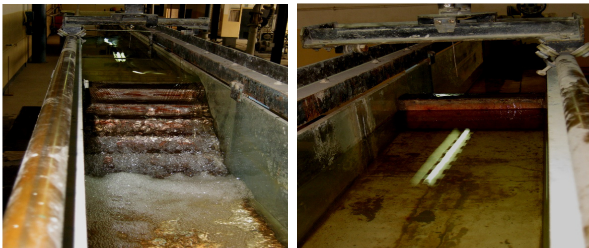
Figure 3: Left: Tilting flume showing approach flow to the model. Right: Flow over the stepped spillway laboratory model