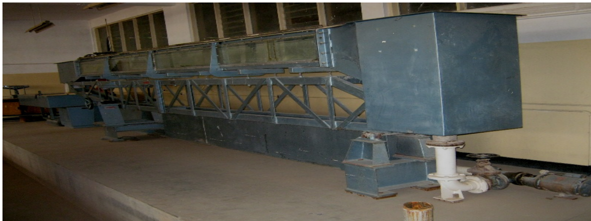
Figure 2: Pictorial view of the tilting flume used for the study.