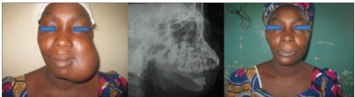
Figure 4: Preoperative appearance, graft in-situ and postoperative photograph

The goals of reconstruction include not only the rehabilitation of the complex mechanism of the normal joint, but also the restoration of facial symmetry, occlusion, and mastication. Four methods have been described for immediate reconstruction: condylar prostheses; [7-9] native condyle; [10-12] costochondral grafts; [13] vascular free flaps (fibula and second metatarsal); [14-16] and fibular free flap with long term follow up of radiological findings. [17] Although titanium prostheses have their advocates, the fibula flap has been widely popularized. [18]