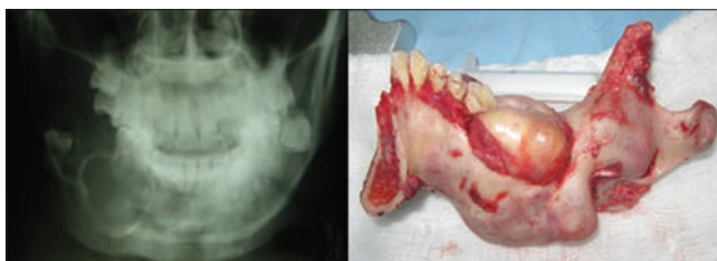
Figure 3: Radiograph and specimen of a large ameloblastoma requiring disarticulation resection

Although this procedure has been described as a relatively rare procedure accounting for 5% of mandibular procedure carried out by Carlson [1] in an 8-year period, it accounted for 24.7% of mandibular resections in our centre in a five-year period. This difference can be explained by the delayed presentation typical of patients in this environment, the fact that study centre is a referral centre for a large population could be another [Figure 3]. Also, routine jaw radiograph used for dental assessment, which often draws attention to the presence of a tumor before facial swelling becomes obvious is not practiced in our environment because of poor level of oral health awareness and poverty. More typically posteriorly located tumors with medullary growth were seen more often in this series.