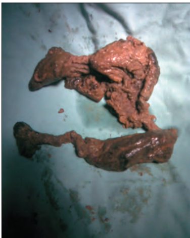
Figure 3: Abdominal sponge removed from resected ileum

range 6–92 years) were most commonly found in the abdomen (56%), pelvis (18%), and thorax (11%). Average discovery time equaled 6.9 years (SD 10.2 years) with a median (quartiles) of 2.2 years (0.3–8.4 years). The most common detection methods