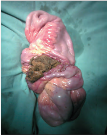
Figure 1: Abdominal sponge protruding out from incised ileal specimen