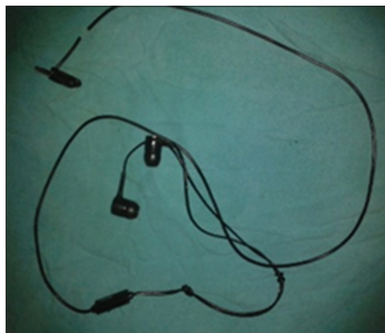
Figure 3: The transected earphone after removal

revealed no psychiatric disturbances. He was followed up in the urologic clinic for 6 months with no sequelae.