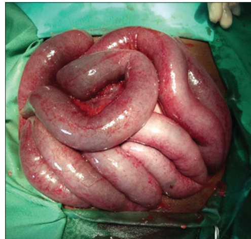
Figure 2: Dilated loops of dusky-red small intestines with petechiae reaction reduced from the pouch and freed from the torsion. The normal pink color returned in <5 min after reduction