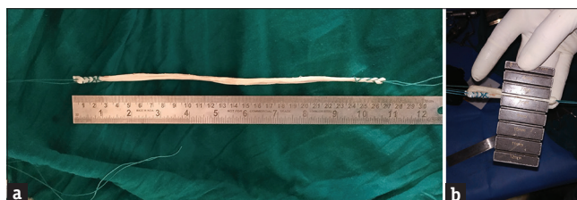
Figure 2: The peroneus longus graft after harvesting (a) Length of the tendon, (b) Thickness of the tendon