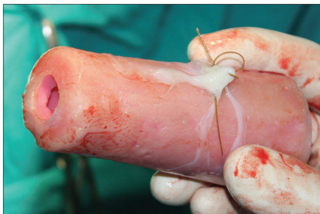
Figure 3: Hollow vaginal stent covered with amnion

is very debatable as the choice of the procedure for reconstruction of neovagina depends upon the anatomical, age, fertility potential, and social factors. [5]