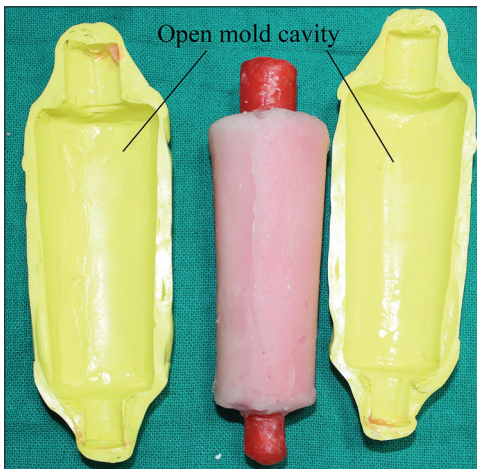
Figure 1: Tissue conditioner-reinforced vaginal stent

Abbe–McIndoe procedure for the creation of neovagina was done after dissecting the fibroconnective tissues between bladder anteriorly and rectum posteriorly by progressively placing the dilators of increasing size. This was done for the depth up to 10 cm. Stent was prepared by immersing the amnion in saline treated with antibiotics and properly secured around the stent with chromic sutures [Figure 3].