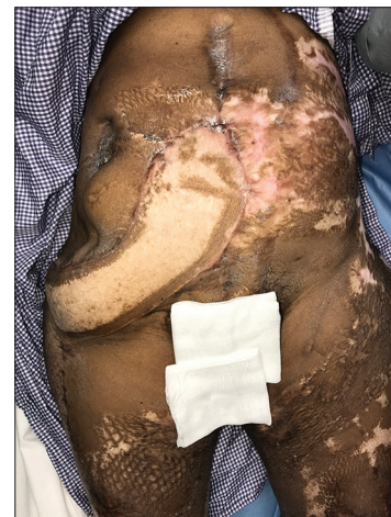
Figure 3: Postoperative after 6 months

are rectus muscle flap, latissimus dorsi muscle flap, and external oblique flap. Distant flap options are TFL muscle flap and rectus femoris flap. Free TFL graft is also an option for abdominal wall reconstruction. [3] The