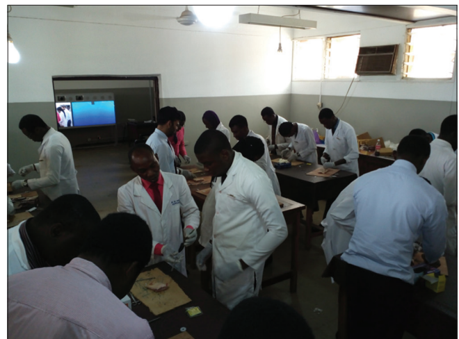
Figure 1: Undergraduate suturing skills training session in Ile-Ife, Nigeria

In self-assessment report after the workshop, all but 3 (1.7%) students felt very confident in handling basic instruments, 102 (56.7%) were confident of their proficiency in basic suturing, 68 (37.8) were less confident, whereas 10 (5.6%) were not confident. On a Likert scale rating, 53.1% of the participants agreed that the time allotted was adequate for their skills acquisition, 15.6% disagreed, whereas 31.3% were neutral. Overall, 160 (88.9%) adjudged the environment of the skills laboratory conducive to skills acquisition.