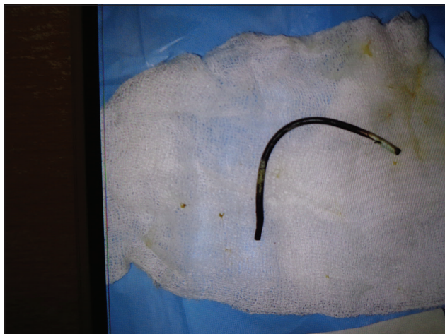
Figure 3: Stent retrieved via colonoscope