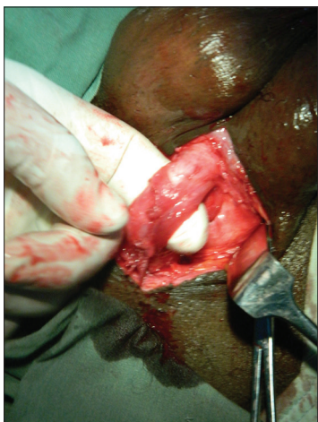
Figure 1: Bulbous urethra mobilized showing the stricture

All the patients were males and 87 in number. The age range was 11–68 years with a mean of 35.4 years and standard deviation 10.5 years. All had one stage anastomotic urethroplasty by perineal approach during the study period of 9 years. Nine (10.3%) patients after the evaluation had erectile dysfunction following urethral trauma. Posturethroplasty four (4.6%) patients experienced a decrease in the quality of penile erection that needed no treatment while 74 (85.1%) patients retained their potency. Thirty-nine (44.8%) patients were in the fourth decade of life. Road traffic accident caused a urethral rupture in 46 (53%) patients followed by straddle injuries in 17 (19.5%) patients [Figure 4]. There were pelvic ring and sacroiliac joint disruptions in 31 (37%) patients [Table 1]. The site of posttraumatic stricture was bulbo-membranous in 39 (44.8%) patients, membranous in 17 (19.5%) patients, and bulbous 31 (35.6%) patients. Road traffic accident caused traumatic stricture in both membranous