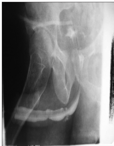
Figure 3: Post urethroplasty retrograde urethrogram

and bulbous segments of the urethra accounting for 52.8%. The stricture/defect length range was 0.8–3.2 cm with a mean of 1.9 cm. Thirty-one (35.6%) patients had bulbo-membranous anastomosis while 21 (24.2%) patients had bulbo-prostatic anastomosis. The remaining 31 (35.6%) had bulbo-bulbar anastomosis [Table 2].