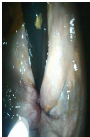
Figure 2: Injection sclerotherapy for internal hemorrhoid using retroflexed endoscope