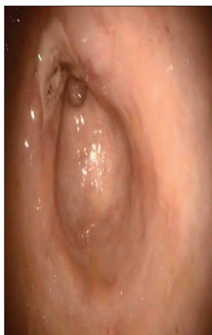
Figure 3: Forrest III gastric ulcer