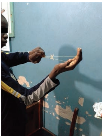
Figure 1: Rubber band used for shooting broomstick

Ocular trauma from broomstick in this study was classified using the Birmingham Eye Trauma Terminology system (BETTS). [12] BETTS broadly classifies ocular trauma into open globe and closed globe injury. Closed globe injuries are classified into lamellar and contusion injuries while open globe injuries are classified into laceration and rupture injuries. Lacerations are further sub-classified into penetrating, perforating and retained intraocular foreign body (IOFB).