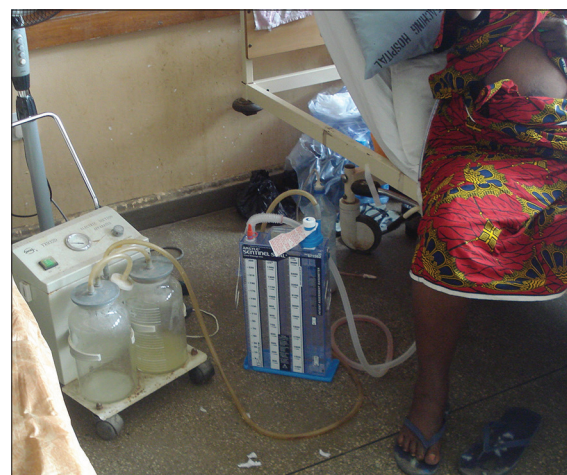
Figure 4: More recent modification of the double or triple bottle systems (e.g., Atrium®, Pleurvac®), been used on a patient and connected to a suction device