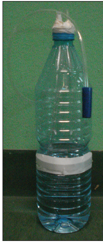
Figure 1: Chest drain improvised from 1.5 L bottled water container. Observe the white plaster tape indicating the underwater seal level. Furthermore, note the tube drain with blue cap, improvised from urine bag tubing and the vent jutting above the summit also strapped with the white plaster tape

passed the cap of a hypodermic needle the covered end of which has been excised so that both ends are open to serve as a vent. Through the 0.5 cm perforation, the tubing of the urine bag (having excised the bag) is passed such that the distal end is inserted into the bottle and the tip placed below the water seal level. At the distal end of the tubing is connected the second needle cap (with the sealed end excised) to ensure the tip is kept straight and always under water. The water seal level is indicated by a length or piece of plaster placed at the waist of the bottle (about midway). The amount drained over time is determined by measuring the fluid volume (using a calibrated jug) above the water seal level. These bottles are not transferrable from one patient to another in other words they are disposed. Patients were followed up with serial chest X-rays until certified cured before removal of the chest tube. Data collected were analyzed with Statistical Package for Social Sciences (SPSS) version 15.0 software program (SPSS 2006, Inc., Chicago, IL, USA).