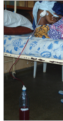
Figure 2: Improvised chest drain in action draining hemorrhagic pleural effusion

A total of 167 patients were managed. There were 106 (63.5%) males and 61 (36.5%) females. The mean age was 34.85 \pm 16.72 with a range of 1-80 years. The most frequent indication was for malignant/paramalignant effusion, 46 (27.5%) [Table 1]. Others were trauma 44 (26.3%), parapneumonic effusion 20 (12%), post-thoracotomy 14 (8.4%), empyema thoracis 12 (7.2%), heart disease and tuberculous effusion 11 (6.6%) each, pneumothorax 8 (4.8%), and misdiagnosis 1 (0.6%). A 101 (60.5%) of the procedures were performed by registrars, 41 (24.6%) by consultants, house officers 15 (9%), and senior registrars 10 (6%). The overall complication rate was 16.8% with more frequent complications been empyema (5.6%) and pneumothorax (3.6%) [Table 2]. The average duration of tube placement was 13.02 \pm 12.362 days and range of 1-110 days.