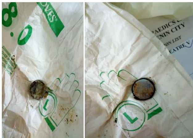
Fig 3 and 4. Anterior and posterior surfaces of the corroded disk battery retrieved.

Four hours post op, he developed stridulous breathing with drooling of saliva. A three day course of intramuscular dexamethasone at 0.15mg/kg/dose 8hourly was administered. Symptoms resolved within 24 hours. Nasogastric tube feeding was commenced four days post operatively and this was well tolerated.