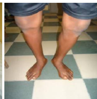
Fig 1b: Photograph of a closer view of the legs and feet