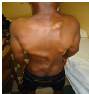
Fig 1a: Photograph of the patient's back

He was admitted for investigations and co-managed with the orthopedic surgeons, physiotherapist and social workers. Counselling was offered, excision of some of the exostoses especially those on the back was advised as well as genetic studies. However, he signed against medical advice, stating financial constraints as main reason, and had since been lost to follow up.