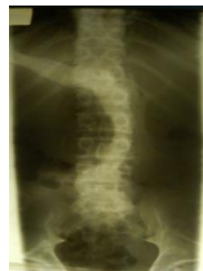
Fig 2: X-ray of thoracolumbar spine from the front