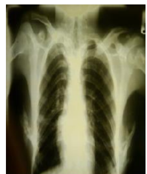
Fig 3: Chest X-ray showing exostoses from rib cage