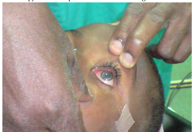
Figure 1. Cestode cysticercus in anterior chamber of eye of 7 year old girl.

The anterior chamber and ocular contents however appeared normal. Histology of the removed mass revealed a tiny fragment of grayish white tissue whose section showed a cestode larva having a cuticle with an invaginated protoscolex and integument (figures 2-4.) These features were suggestive of eucestoda infestation with propagation of the cysticercus in the eye. Stool examination for microscopy of ova and parasite were however negative.