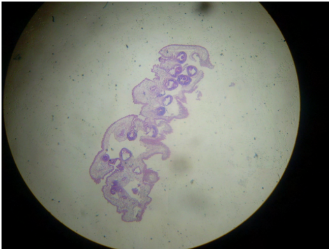
Figure 2. Microscopic section of the cestode worm after surgical removal from the anterior chamber of eye H&E X400.