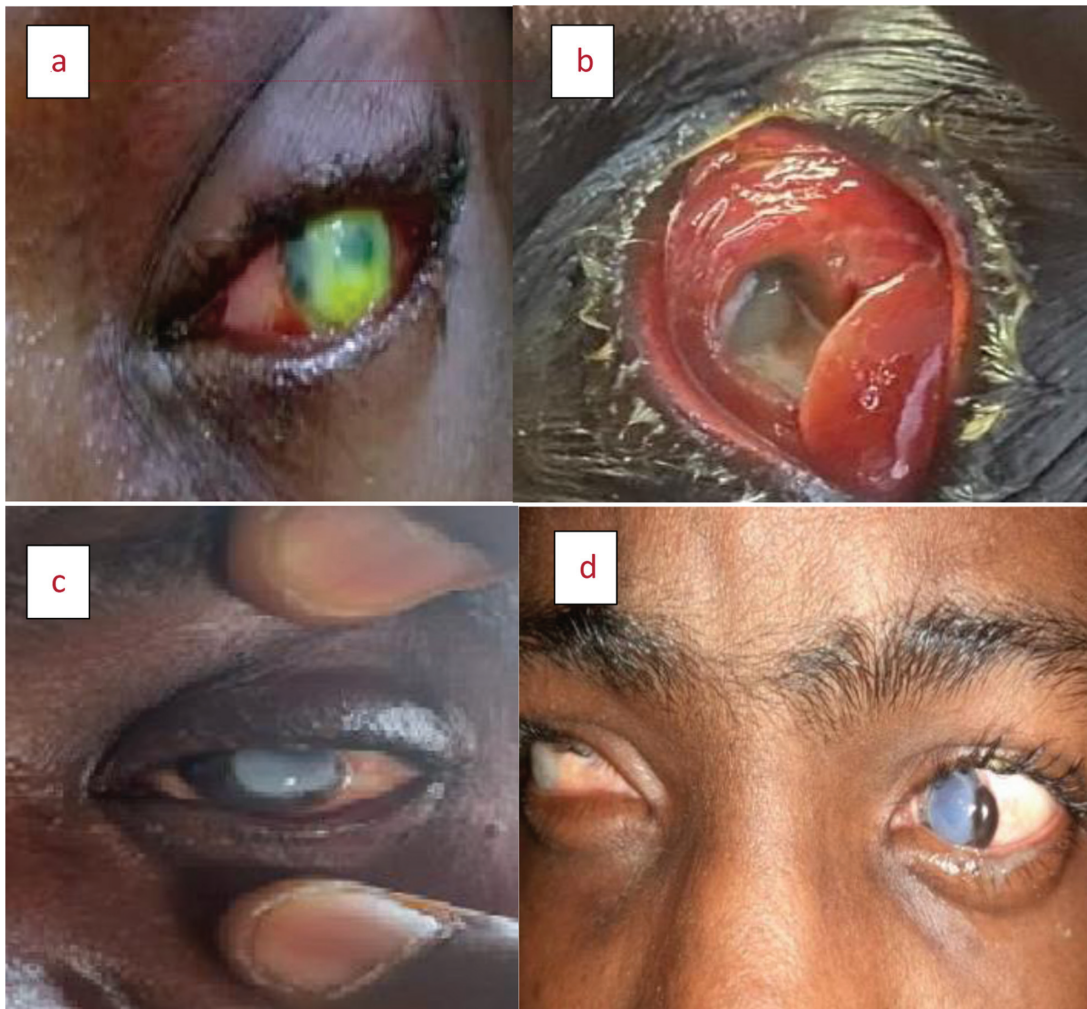
Figure 2: (a) Patient with left hypopyon ulcer following trauma with history of use harmful traditional medicine. (b) Case of corneal ulcer with auto-visceration at presentation. (c) Peripheral cornea ulcer. (d) Bilateral Mooren ulcer, RE healed with scarring, LE perforation and uveal prolapse at presentation. LE = Left Eye, RE = Right Eye.