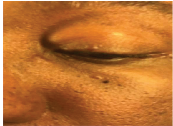
Figure 2: Left Eye Sarcoidosis Lesion Pre-Treatment