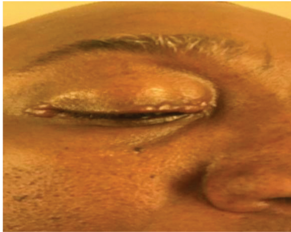
Figure 1: Right Eye Sarcoidosis Lesion Pre-Treatment

A skin biopsy was taken. Histopathology reports showed a chronic inflammatory lesion, characterized by numerous confluent granulomas in the superficial and deep dermis composed of aggregates of epithelioid macrophages occasionally sprinkled with sparse infiltrates of lymphocytes and giant cells with dermal fibrosis. No caseation or cellular atypia reported [Figure 3a–e]. These features are characteristic of sarcoidosis. QuantiFERON TB Gold test was negative for tuberculosis. Chest X-ray report