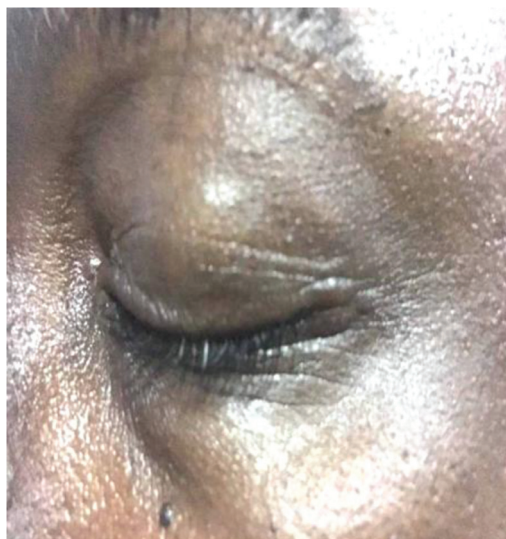
Figure 5: Left eye 1 month Post Treatment

showed matted nodular dense masses at the hilar areas and the lung fields were clear.