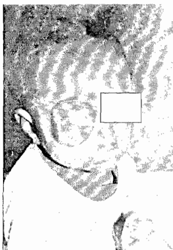
Figure 1. Plain photograph of the patient (with normal eye concealed)

No abnormality was noted on general and systemic examination. However, examination of the eye and its adnexae revealed a massive, non-axial proptosis with superonasal displacement of a deformed, blind right globe. Manual reduction of the proptosis failed. A large fluctuant, non-tender ill-defined mass of variable consistency in some portions was noted to be continuous with the deformed globe. Other findings included conjunctival keratinization, chemosis and an opaque, lustreless, keratinized cornea; which precluded further visualization of deeper ocular structures. There was also restriction of ocular motility