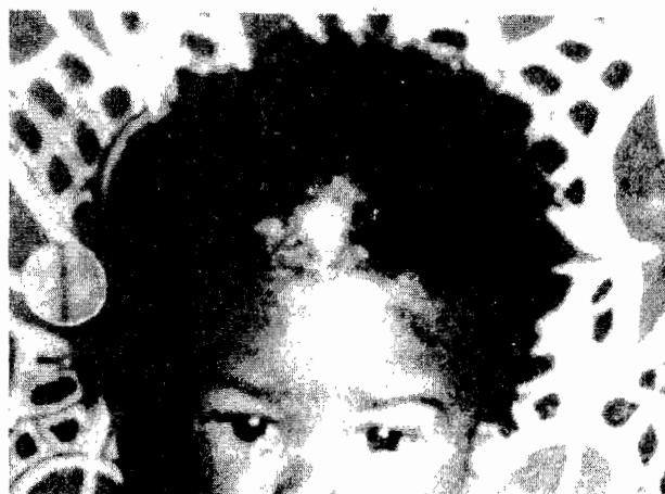
Figure 2: White Forelock in Younger Sister