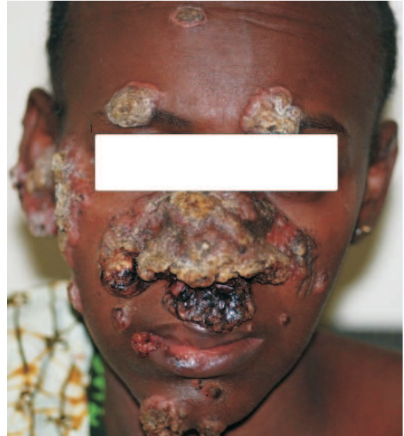
Fig. 2 -ulcerated and crusted nodule second visit