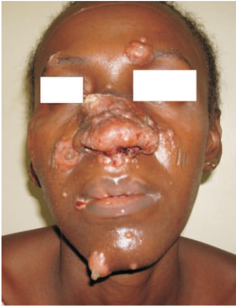
Fig. 1 papulonodular lesions at presentation