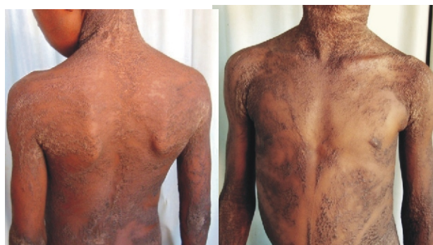
Figure 1 & 2: Extensive verrucous skin lesions along the lines of Blaschko

The patient was prescribed oral retinoids and topical salicylic acid, the former was not available in the country, while the latter was used for 6 months without appreciable response.