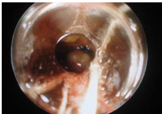
Figure 1: Actively bleeding oesophageal varix with a band applied at its base after suction into the Opti-vu barrel-shaped cup at the tip of the gastroscope.