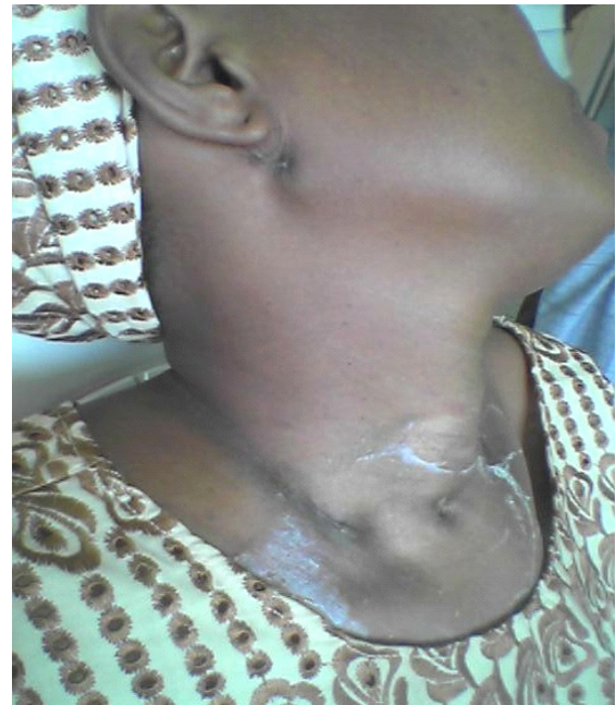
Fig III. Healed sinus formations.

The discharge from the abscess sites stopped and wound healed (fig 3). Patient was discharged after 22 days to the medical out patient clinic for continued management of the pulmonary tuberculosis.