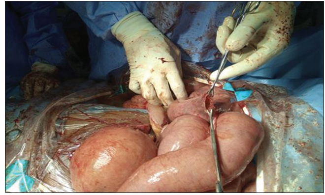
Figure 3: Perforated bowel noticed during untwisting of the second volvulus

Intestinal volvulus usually presents in the second and third trimesters. [1] This is because the rapidly enlarging gravid uterus distorts the anatomical location of the intra-abdominal viscera mainly between 16–20 and 32–36 weeks of gestational life. [10-13] Furthermore, relaxin, a hormone which is released during pregnancy increases tissue pliability and decreases motility of the gastrointestinal tract. [1] Both of these factors when combined in individuals already susceptible to volvulus predispose to midgut volvulus in pregnancy. Despite this higher propensity in the third trimester, as in the case presented, there have been reports of this complication developing in early pregnancy as well as the puerperium. Sherer and Abulafia described a case of postpartum volvulus after caesarean delivery. [14]