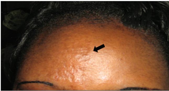
Figure 1: Scars on the right frontal area (black arrow) supplied by the ophthalmic branch of the trigeminal nerve secondary to healed herpes zoster ophthalmicus