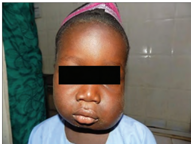
Figure 2: Facial edematous stage

The management of the incipient gingivitis stage of noma includes oral hygiene measures such as scaling and polishing, use of antimicrobial mouth rinses. [3] The use of antibiotics and wound debridement is used when the lesion extends beyond the gingiva tips and margin. Medical and nutritional support is also required in the management of the different stages of the active disease. Medical management of noma includes the treatment of existing diseases such as malaria, respiratory tract