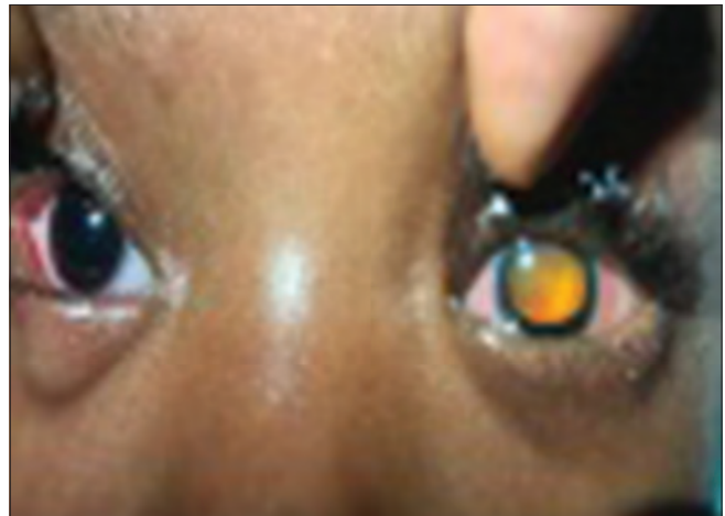
Photograph 2: Left leukocoria and red eye in advanced unilateral retinoblastoma