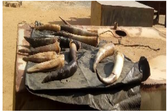
Figure1: Sun Dry of Cattle Horn

sizes of 1-3mm pellets using shredder shown in Figure 3. Then, it was air dried for 10hrs (Atuanya, et al. , 2011; Idowu and Adekoya, 2015).