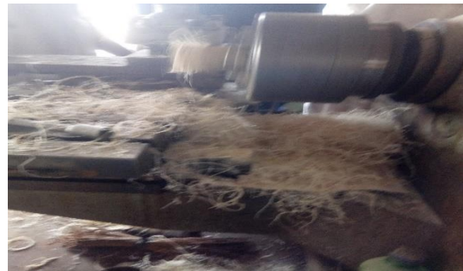
Figure 2: Production of Cattle Horn Fiber on Lathe machine