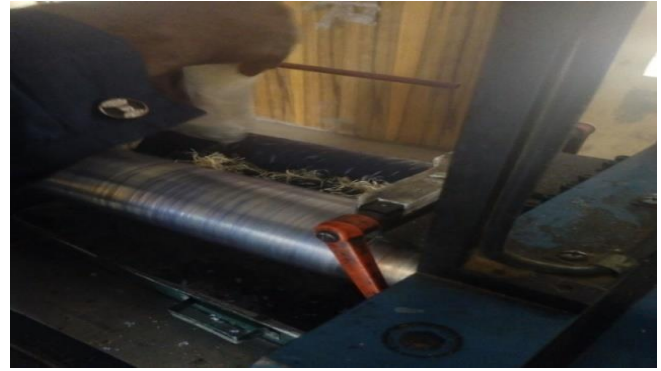
Figure 4: Production of Composite in Compounding Machine

Besides, the compounding product was then charged into a metal mold of 250x250x5mm which was already preheated to about 100°C and coated with releasing agent. This is to grant virtually uniform cooling and ease the removal of sample from the mold after cooling. Subsequently, it was quickly transferred into hydraulic hot press shown in Figure 5 where the mold was subjected to a pressure of 0.4MN/m 2 at temperature of 150°C for further compaction for 5 minutes, here after it was allowed to cures (Samotu, et al., 2015; Kumi-Larbi, et al., 2018; Ogunsile and Oladeji, 2016; Bala, 2016).