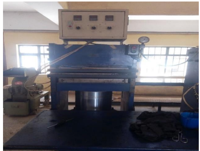
Figure 5: Compression of the Composite