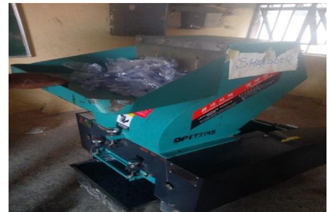
Figure3: Waste Pure Water Sachets on Shredder

Sodium hydroxide was purchased and used in different molarity ranging from 0.1 to 0.3M for fiber modification. The modification was done by soaking the Fiber with 0.1, 0.2 and 0.3M of NaOH for 4 hours. Then, it was removed, washed and dried at a room temperature (Peças, et al. , 2018; kumar, et al. , 2016).