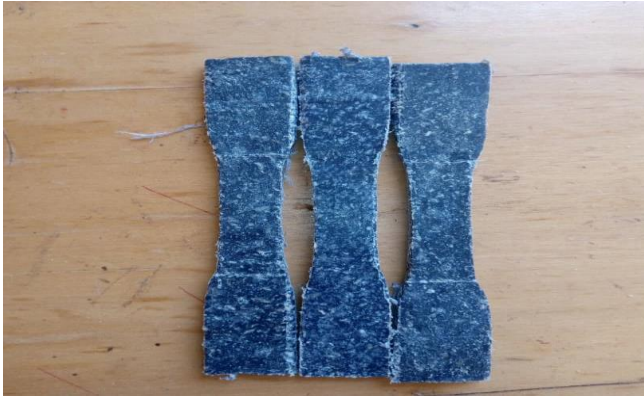
Figure 6: Tensile Test Samples