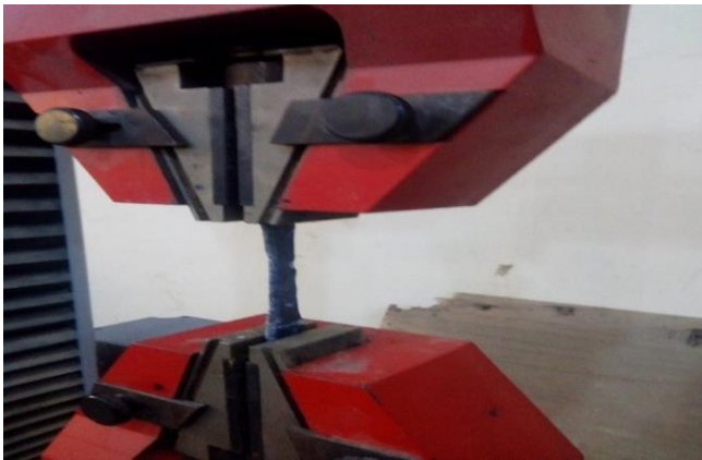
Figure 7: Sample Loaded on UTM

Experimental results of tensile property for the nine samples obtained from L9 orthogonal array were processed by Minitab for Taguchi analysis, models and optimization. During the analysis, signal to noise (S/N) ratios was generated for the property. Signal connotes the desirable value (mean) while ‘noise denotes undesirable value (standard deviation from the mean). S/Nratio commonly known as measure of quality Characteristics and deviation from the desired value (signal). In generating thisratio, the larger-the-better criterion equation was employed, because the higher the tensile strength of material, the more desirable the material for engineering applications. Additionally, this is in compliance with other research (Navaneethakrishnan and Athijayamani, 2015; Kumar, et al., 2017; Mohamad, et al., 2019)